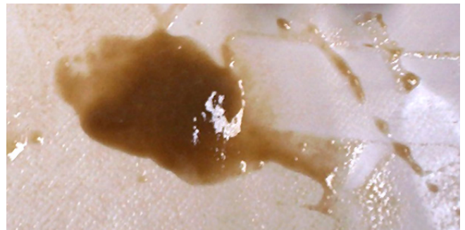
Effectively removes membrane biofilms

Available in 10 kg and 25 kg plastic pails and 1,000 kg bulk bags. Under normal storage conditions the shelf life of Genesol 734 is 1-2 years. Ensure the packaging is sealed after use and the Genesol 734 remains dry.